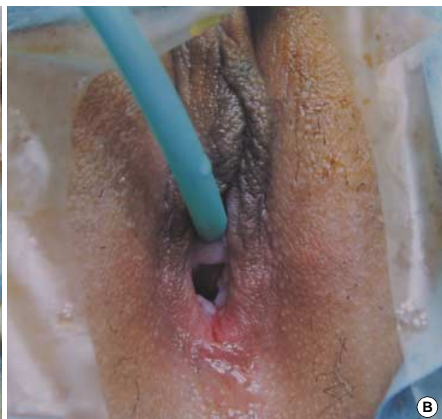
Fig. 3. The integrity of hymen preserved after the hysteroscopic resection of the vaginal septum (A: pre-operation, B: post-operation).