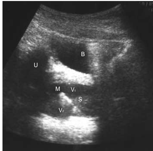
Fig. 2. A transabdominal ultrasound image acquired during the operation. The tip of the minihysteroscope (M) in the left obstructed hemivagina (V 1 ) after puncturing the vaginal septum. B, bladder; S, obstructed vaginal septum; U, left uterus; V 2 , fluid filling the right vagina.

Under general anesthesia, we performed a hysteroscopy without speculum or tenaculum. For endoscopy, a 3.5-mm minihysteroscope (Versascope, Gynecare, Ethicon, Somerville, NJ, U.S.A.) was used to preserve the integrity of the hymen; saline was used as a distending medium. Because of the large bulging mass, vaginal space appeared narrowed. An endoscopic vaginal exploration showed the presence of a