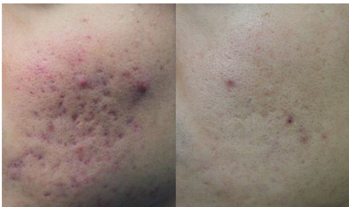
Fig. 1 Clinical photographs of a 19-year-old male patient with acne scars before and after treatment with fractional laser (left: before treatment, right: after three sessions of fractional laser treatment)

Values are presented as number (percentage) or median (interquartile range, IQR)