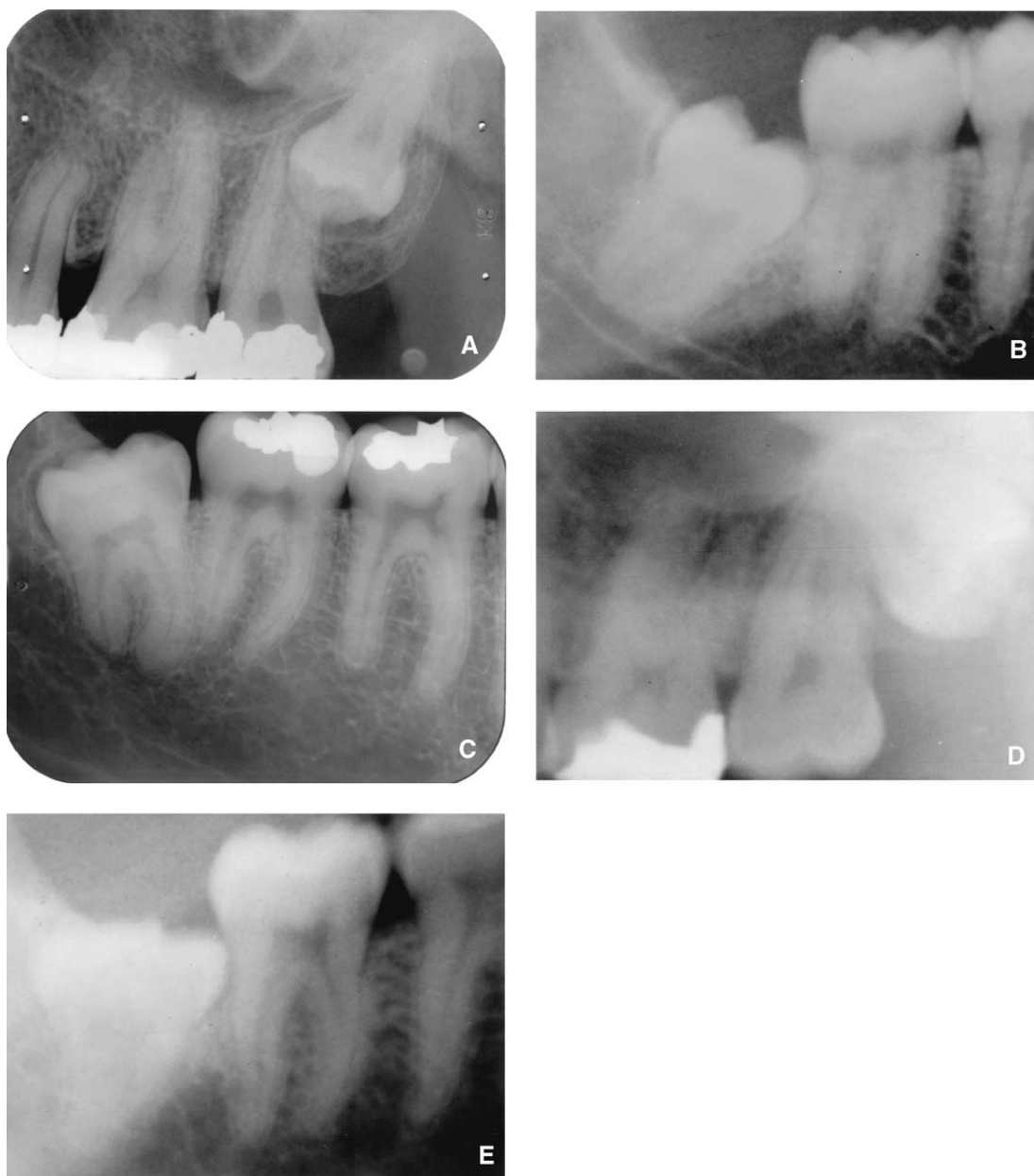
Fig 2. Periapical and sections of panoramic radiographs of patients in our sample: A , at 33 years 9 months, illustrating mesial impaction of maxillary third molar; B , at 29 years 2 months, illustrating mesial impaction of mandibular third molar; C , at 30 years 1 month, illustrating distal impaction of mandibular third molar; D , at 39 years 5 months, illustrating distal impaction of maxillary third molar; and E , at 29 years 6 months, illustrating vertical impaction of mandibular third molar.

(20.7%) of the 82 patients with U-ES greater than or equal to 18 mm experienced impaction. The smallest U-ES associated with eruption was 13.0 mm, and the largest U-ES associated with impaction was 24.0 mm.