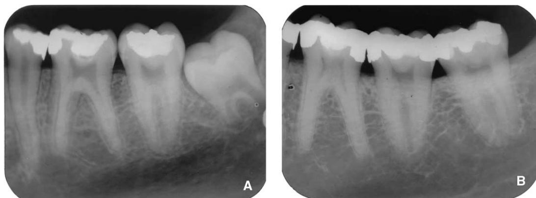
Fig 1. Periapical radiographs made at A , 15 years 9 months, and B , 29 years 10 months of a patient who had received orthodontic treatment with extraction of 4 first premolars. Note eruption of mandibular third molars during final stage of root formation despite apparent impaction at age 15 years 9 months.

of extraction therapy on maxillary third molar impaction is very limited.