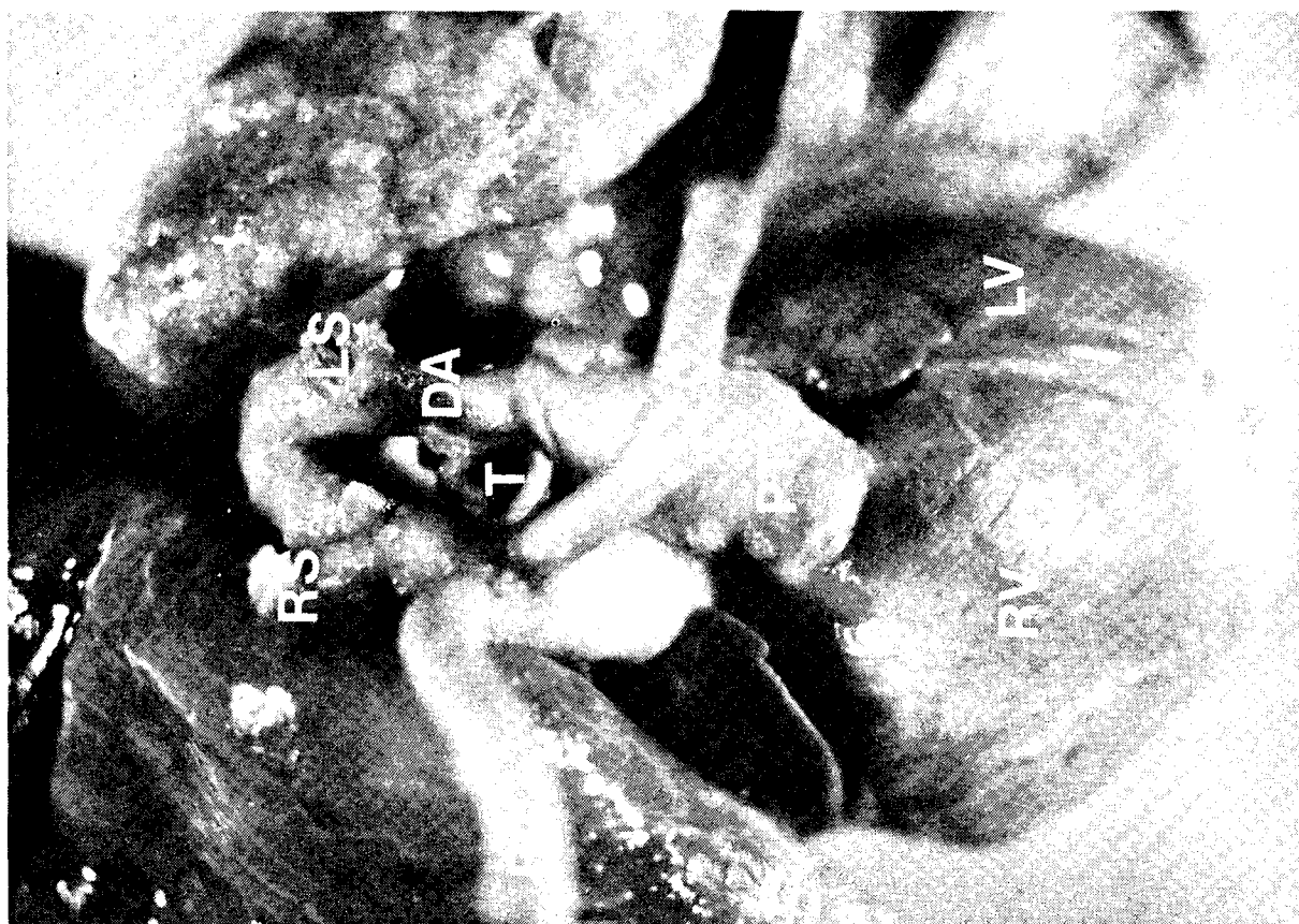
Fig. 2. Superior view of the vascular ring. The tracheoesophageal tree is encircled by a vascular ring formed by both common carotid arteries (LC, RC), right subclavian artery(RS), left subclavian artery(LS), and ductus arteriosus(DA). PT: pulmonary trunk, A: Aorta