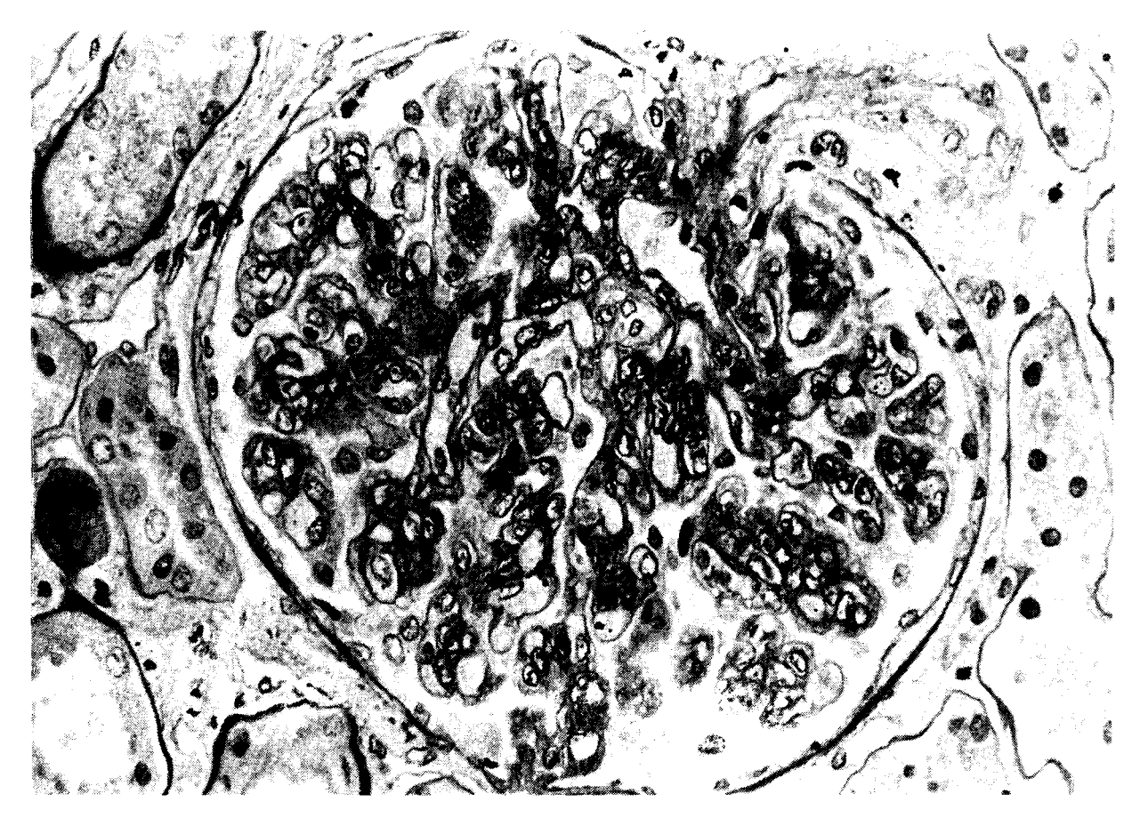
Fig. 1. Light micrograph of a glomerulus showing prominent increase in mesangial substance and localized thickening of peripheral capillary loops with mesangial interposition. PAS stained; original magnification, (x400).

Her blood pressure normalized with antihypertensive drugs. Repeated tests for lupus were all negative. At the last follow-up three years following biopsy, she showed no clinical sign of SLE but microhematura and slight proteinuria persisted with HBs antigenemia.