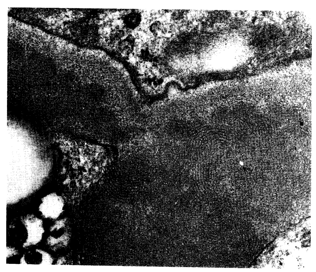
Fig. 3. Same glomerulus as in Figure 2 showing bundles of curved electron-dense bands fingerprint patterns. EM (x39,000).