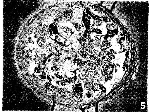
Fig. 5. Microscopic section of the atretic segment. Abnormal development of tracheal cartilage and occasional epithelial remnants are seen.

cord structure was seen. The occluded portion was microscopically composed of fibrocollagenous tissue with occasional and irregular islands of mucous glands. No other element was seen. The cartilage of larynx was also abnormally formed.