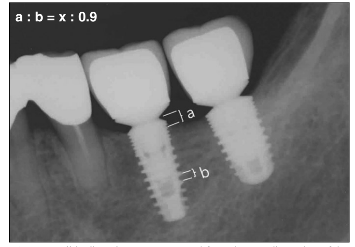
Fig. 1. Possible distortion was accounted from the true dimension of the implant. The proportional expression to calculate the amount of marginal bone level change is shown on the upper left part of this figure (a: distance between fixture-abutment interface and the first visible bone to implant contact measured from radiograph b: pitch distance measured from radiograph x: assumed amount of real bone change, 0.9: pitch distance between macrothreads).

The radiographs were taken perpendicular to the long axis of the implants with a long-cone parallel technique. The crestal bone level was measured from the fixture-abutment interface to the first visible bone-to-implant contact (BIC). The authors calculated the change in the crestal bone level using the original dimension of the inserted implants. The pitch distance between macrothreads of Inplant™ was 0.9 mm. The true crestal bone level was calculated through the proportional expression using the actual and radiographically measured values of the macrothread pitch (Fig. 1). The crestal bone level at the time of delivery of the final restoration was regarded as a baseline. The marginal bone loss was defined as the difference between the true crestal bone levels at the baseline and each appointment. It was measured at both the mesial and distal aspects of each implant.<sup>19</sup> A single investigator performed the radiographic analysis.