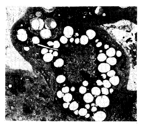
Fig. 8. Electron micrograph of a sclerotic glomerular segment showing extensive foam cell formation with lipid-containing vacuoles and cholesterol clefts. \times 4,300

lipid material in hyalinosis lesion in rats with experimental nephrosis was also described by Olson et al. (1985), its frequency or morphologic detail is not clearly defined. In fact, the foci with the increased accumulation of lipid droplets in the subendothelial regions of glomeruli are often