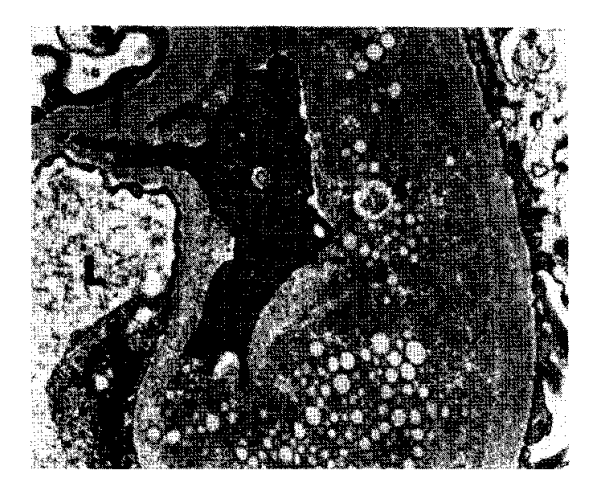
Fig. 7. Electron micrograph of a portion of a glomerulus showing accumulation of lipids in mesangium admixed with proteinaceous material. L, capillary lumen. ×15,000

lipid material in hyalinosis lesion in rats with experimental nephrosis was also described by Olson et al. (1985), its frequency or morphologic detail is not clearly defined. In fact, the foci with the increased accumulation of lipid droplets in the subendothelial regions of glomeruli are often