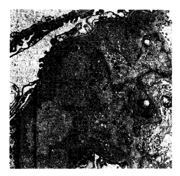
Fig. 6. Electron micrograph of a portion of a glomerulus showing widened mesangium filled with flocculent electron-dense material and less electron-dense fat vacuoles (arrowheads). × 9,300