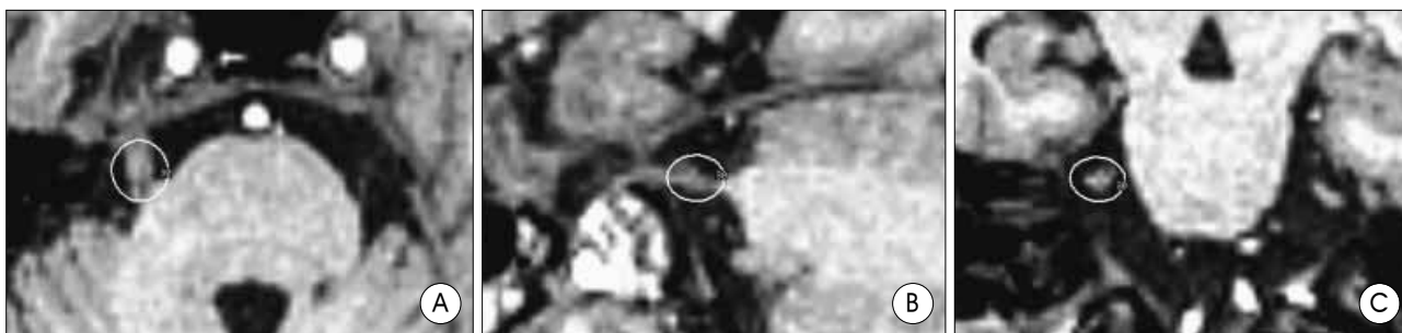
Fig. 1. This picture depicts Gamma knife radiosurgery targeting for trigeminal neuralgia. The root entry zone of the trigeminal nerve was targeted so that the 30% isodose surface contacted the edge of the pons. The circle represents the 30% isodose curve. (A : Axial image, B : Sagittal image, and C : Coronal image).

Statistical evaluations were performed using commercially available statistical software (SPSS version 10.0, SPSS Inc.). Descriptive statistics were computed using standard methods of calculating median or mean values. Univariate and multivariate analyses were performed to assess variables predictive of a pain-relief outcome and pain recurrence after GKS. For group comparisons of categorical data (nominal data or ordinal data), the two-tailed Fisher's exact test and Pearson's chisquare test were used. The unpaired Student t-test was used for continuous variables. In all cases, two-tailed probability values were calculated and statistical significance was defined as a probability value of less than or equal to 0.05.