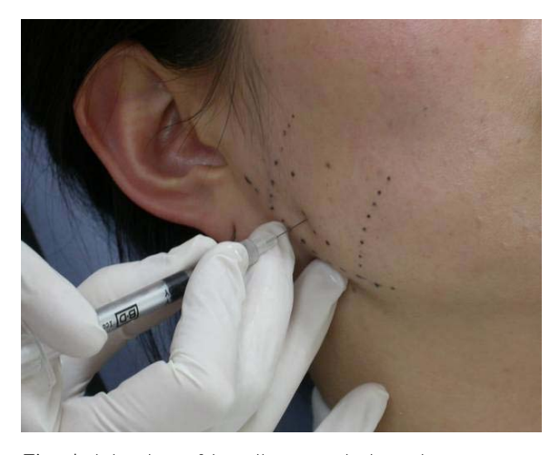
Fig. 1. Injection of botulinum toxin into the masseter muscle area. Injections were divided by three sites along the mandibular angle area.

The raw EMG signal was amplified and converted to a root mean square (RMS) value. We estimated