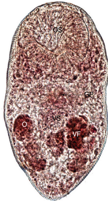
Fig. 3. An adult worm of Parvatrema duboisi from the intestine of a great knot. Note that the vitelline follicle (VF) is present as a single mass. OS, oral sucker; VS, ventral sucker; GP, genital pore; O, ovary; T, testis. Bar = 30 μm.

Total 79 Parvatrema specimens were collected from the intestines of birds, and the taxonomic analysis revealed 2 species of Parvatrema ; 27 (1 species) from the great knot and 52 (another species) from the Mongolian plover. The former species had the following morphologic characteristics (Fig. 3). Body tiny and ovoid, 289 (198-410) μm long and 162 (123-228) μm wide at the midbody. Oral sucker subterminal, large and muscular, 90 (75-120) by 93 (75-113) μm in size. Ceca short, and genital pore, a slit-like opening, was at some distance from the ventral sucker. Ventral pit absent. Ventral sucker round, located posterior to midline, 46 (30-58) by 46 (28-65) μm. Sucker ratio (OS/VS) 2 : 1. Seminal vesicle anterodextral to the ventral suck-