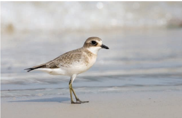
Fig. 2. A Mongolian plover, Charadrius mongolus , a natural definitive host for Parvatrema homoeotectum , from a coastal area of Gunsan-si, Jeollabuk-do.

to our laboratory at 4°C and the intestines were separated. They were opened longitudinally in saline, and the intestinal contents were examined for the presence of parasites. The trematode specimens were fixed in neutral 10% formalin, stained with carmine, and observed for species identification.