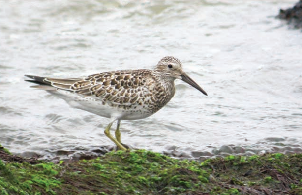
Fig. 1. A great knot, Calidris tenuirostris , a natural definitive host for Parvatrema duboisi , from a coastal area of Gunsan-si, Jeollabuk-do.