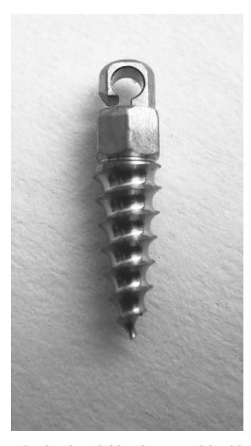
Figure 1. The orthodontic mini-implant used in this study (2005H, ORTHOplant, BioMaterials Korea, Seoul, Korea; self-drilling type, conical shape with 2.0-mm upper diameter, 5-mm length).

type of OMI from one manufacturer with the same implantation protocol and purpose. Also, to determine the risk factors associated with the failure rate, clinical characteristics, including sex, age, craniofacial skeletal pattern, and site and side of implantation, have to be examined. Most OMIs are used in the upper arch for the maximum posterior anchorage during retraction of the upper anterior teeth. Therefore, the purpose of this study was to assess the success rate and the risk factors associated with RI-OMIs placed in the upper buccal attached gingiva (BAG) after initial failure.