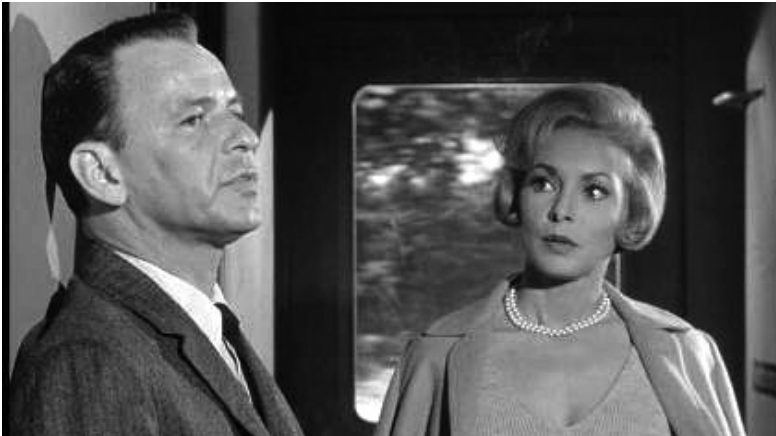
〈Figure 4〉 Marco and Rosie

It turns out that even the brainwashing was not an Oriental tactic first picked up by the communists but a method Mrs. Iselin has long-practiced on her son. 40) In several instances, Raymond puts his hands over his ears to shut down his mother's voice. Nevertheless, he always succumbs to his mother's words, as he confesses to Marco in his drunkenness, "She won, of course. She always does, I could never beat her, I still can't." In the scene where she reveals to her son that she is his communist controller, she makes Raymond repeat herself word by word as if to imprint each of her word into his brain. It is consequently the domineering mother, clad in cheongsam , who replaces the chief Chinese brainwasher Yen Lo. Toward the end of the film, Marco also takes the place of Yen Lo with the new deck of the cards. Yet the most striking instance in which Asianness is reconceptualized is in the absurd exchange between Marco and Rosie. 41)