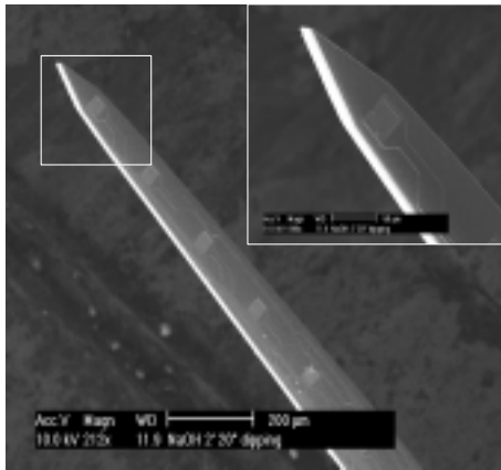
Fig. 2 SEM view of silicon multichannel microelectrode

Device shafts were 5 mm long and 50 \mu\text{m} x 128 \mu\text{m} in cross-section (Fig. 2). Antibodies to GFAP (astrocytes), laminin (vasculature), and CD11b (microglia) were used to assess reactive responses around insertion sites at 1 hr, 24 hrs, 1 wk, and 6 wks. Results show dramatic differences in the magnitude of cellular responses in different brain regions. Immuno-reactivity in the hippocampus was stronger than in other regions (Fig. 3). In thalamus, staining for GFAP and laminin were relatively less intense, while CD11b was comparable. Laminin expression in all regions extended considerable distances from probe sites at 1 hr, and decreased at later times.