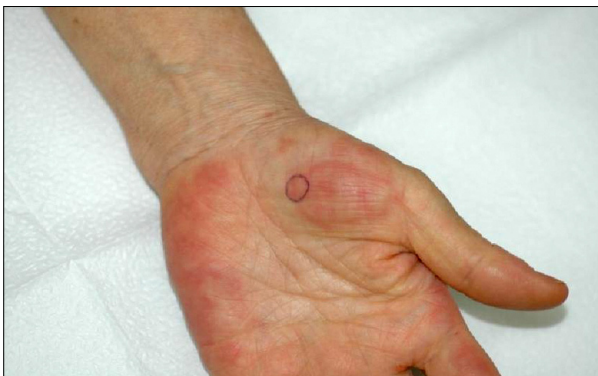
Fig. 1. Multiple confluent annular purpuric erythema with central clearing on both palms.

Multiple confluent annular erythematous patches were observed on both palms (Fig. 1). A skin biopsy performed on an erythematous part of the palm demonstrated the presence of lymphohistiocytic infiltration around the blood vessels of the upper dermis, edema of endothelial cells and extravasation of erythrocytes (Fig. 2). Diagnosis of ALV was confirmed. The patient was treated with dapsone 200 mg/day, aceclofenac 200 mg/day, levocetirizine 5 mg/day and fexofenadine 180 mg/day for 1 week fol-