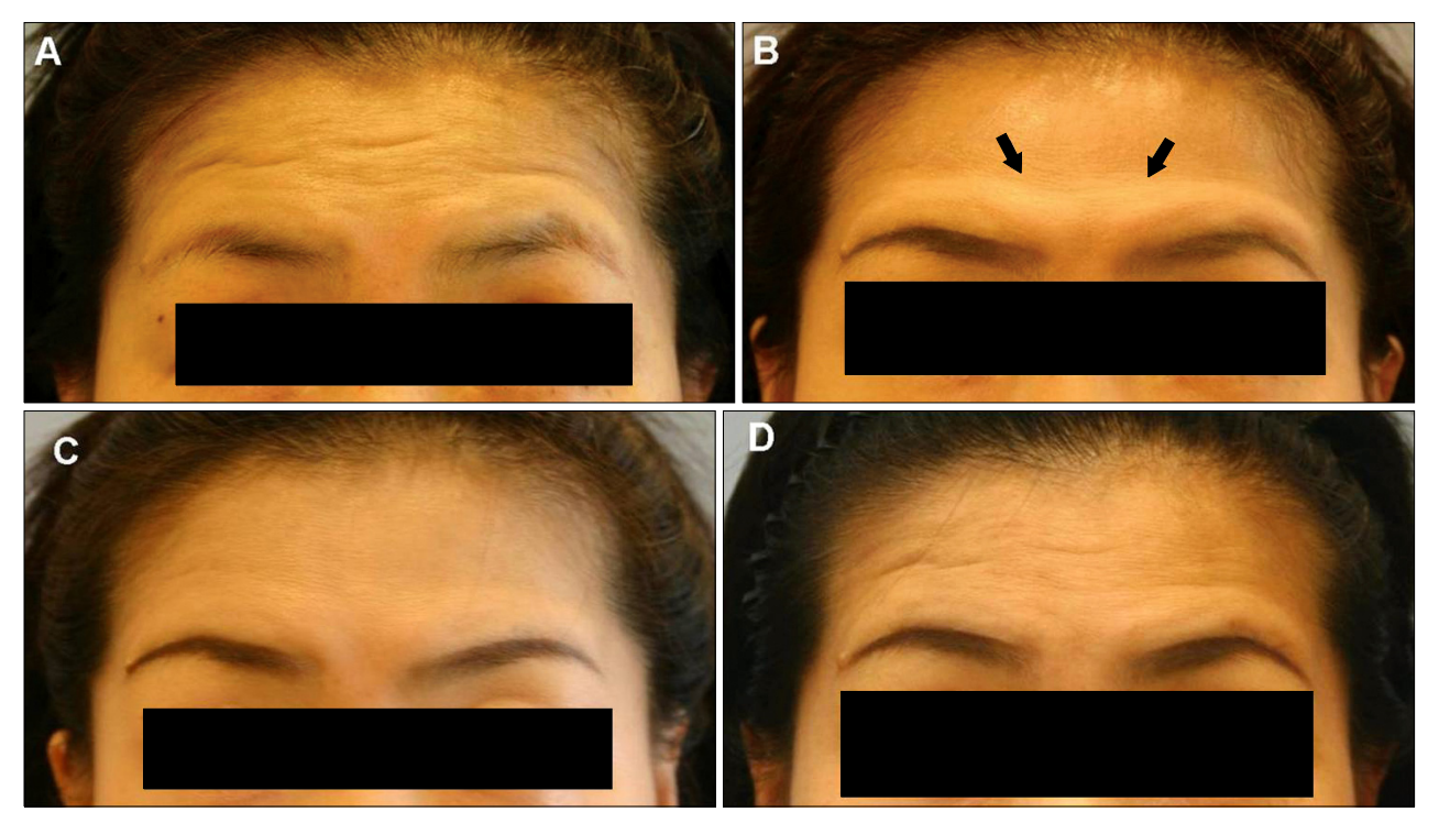
Fig. 1. Case 1: Patient before treatment at maximal forehead wrinkling (A), one week after treatment (B) and at 4 (C) and 16 (D) week follow-ups.

Botulinum toxin can improve facial rhytides via weakness