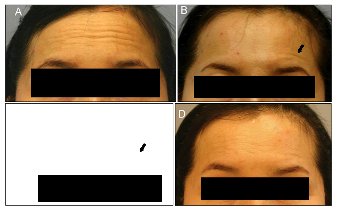
Fig. 3. Case 3: Forehead wrinkling with maximal upward gaze prior to treatment (A) and at 2, 4, and 8 week follow-ups ( B \sim D ).