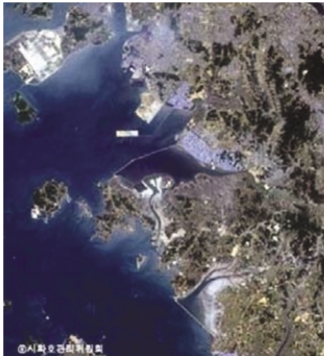
Figure 2. Lake Shi-Hwa and Surrounding Region